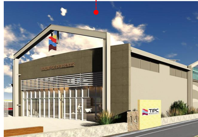
Adventure cruise terminal building